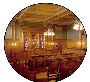
Division 1 Courtroom from 1903 restored to its original condition.

Visit the Division 1 Courtroom . Find the two female figures of north and south walls of the courtroom. What do they represent and why do you think these were important in Colorado in 1903?