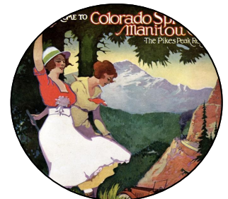
Tourist advertisement of Colorado Springs and Manitou Springs.

Visit Marketing the Mountain . List a few of the aspects of Colorado Springs that appealed to tourists and residents. What draws people to visit and live here today?