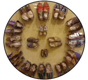
A circle of American Indian moccasins pointing to the four cardinal directions.

Visit Cultural Crossroads . The first people in the Pikes Peak region were American Indians. These communities participated in complex systems of trade in which they acquired materials from around the world. Find and describe an object in the exhibit that features materials traded from a variety of locations.