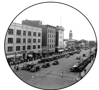
Looking South Along Tejon Street by Harry L. Standley, 1927.

Visit the Behind the Lens exhibit. Consider the different ways these regional photographers chose to depict their community. Which photographer's work do you like the most and why?