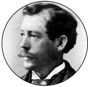
Portrait of General William Jackson Palmer, the founder of Colorado Springs.

Visit the William J. Palmer exhibit. This former Civil War general and secretary-treasurer for the Kansas Pacific Railroad founded Colorado Springs in 1871. What was his vision for this city? Do you think his vision still reigns true today?