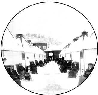
Tent cottage for Tuberculosis patients.

Visit Health in the Pikes Peak Region . Many people suffering from Tuberculosis, also known as consumption, moved to the Pikes Peak region for treatment. What about the "City of Sunshine" made it beneficial to these health seekers?